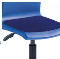
Seat Pad SP