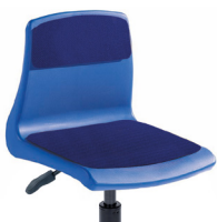
Seat & Back Pad SBP