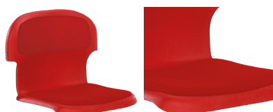
Seat & Back Pad SBP