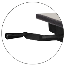
Side crank handle example