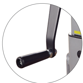
Side crank handle

Oval shaped height adjustable legs from 512-805mm