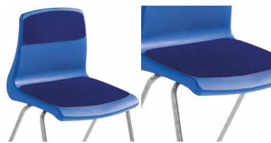
Seat & Back Pad SBP