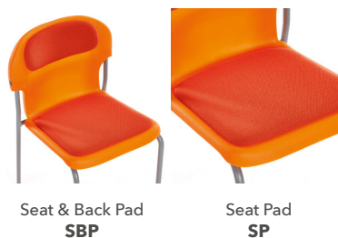
Seat & Back Pad SBP