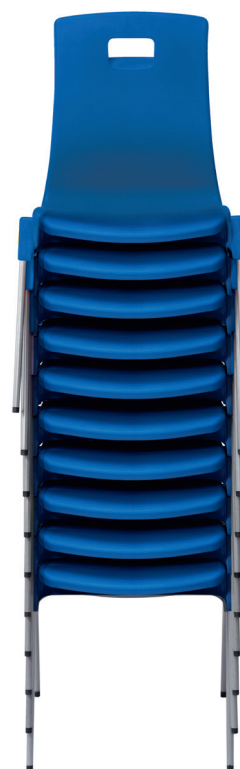
ST Chair stackable to 10 high.